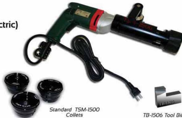
Standard TSM-1500 Collets

All TSM-1500 Collets are made of hard anodized aluminum for maximum hold and minimal weight. Their three-piece design ensures accurate centering while affording the most surface area contact for the greatest holding power.