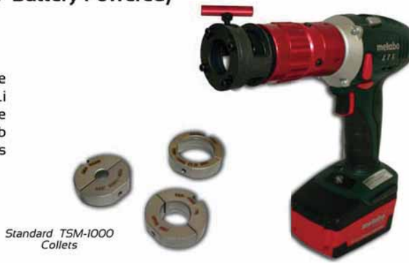
Standard TSM-1000 Collets

TSM-1000 is one of the smallest designed facing tools on the market today. The machine is powered by an air cooled 18V-Li Metabo battery motor and the total working weight of the machine is 6 lbs. The design of this machine makes it easy to use on job sites, making hard-to-reach areas easily accessible due to it's small size.