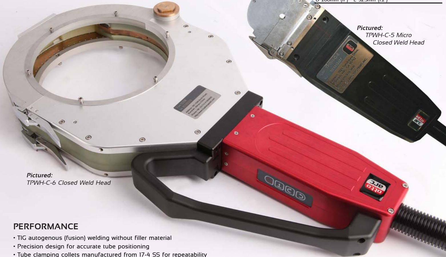
Pictured: TPWH-C-6 Closed Weld Head